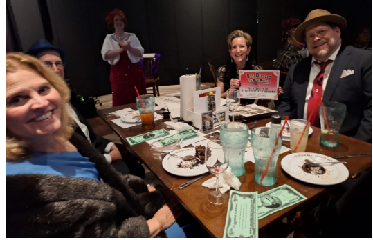
"Best Dressed" table of Gangsters.